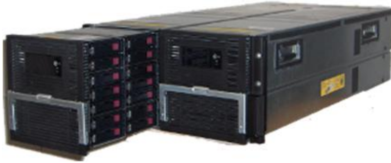
Figure 2. HP StorageWorks 600 Modular Disk System

The EVA4400 pictured in figure 3, offers an easily deployed enterprise class virtual storage array for midsized customers at an affordable price. With built in virtualization, it is designed to improve capacity utilization and be easy to manage, which lowers the cost of ownership compared to traditional arrays. The EVA4400 has high performance, scales easily, and is highly reliable and available.