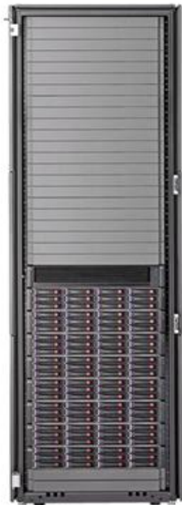
Figure 3. HP StorageWorks 4400 Enterprise Virtual Array

The EVA4400 pictured in figure 3, offers an easily deployed enterprise class virtual storage array for midsized customers at an affordable price. With built in virtualization, it is designed to improve capacity utilization and be easy to manage, which lowers the cost of ownership compared to traditional arrays. The EVA4400 has high performance, scales easily, and is highly reliable and available.