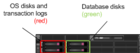
Figure 2. LFF 4 disk configuration

Figure 2 represents the four disk storage layout, using either MDL SATA or SAS disks, two disks are used for the OS and transaction logs and two disks are used for the databases.